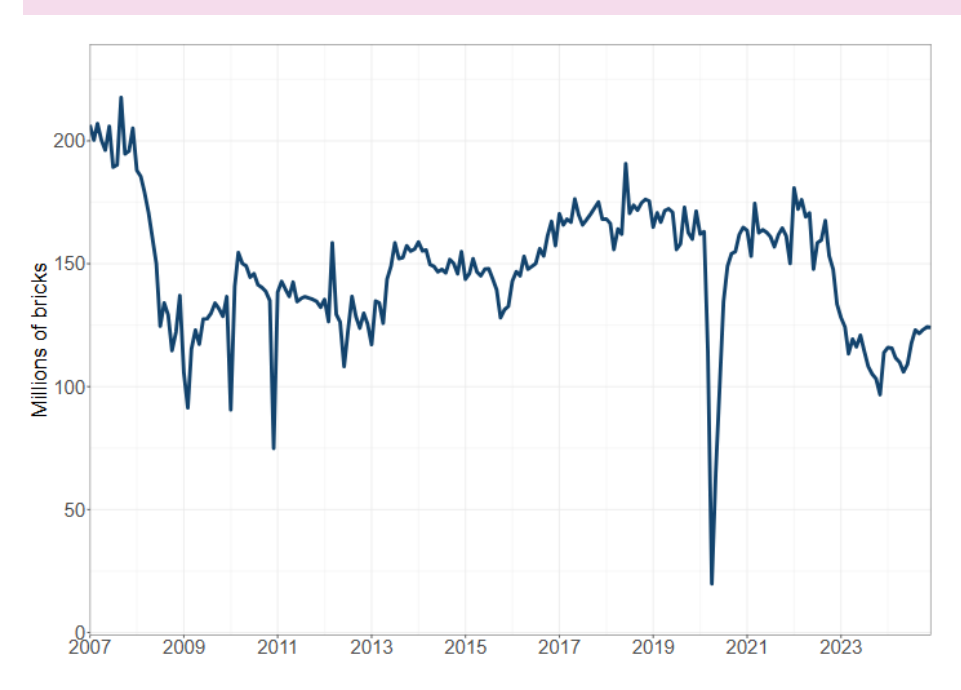
Figure 2: Monthly seasonally adjusted deliveries of bricks (in millions), Great Britain, 2007 to January 2025