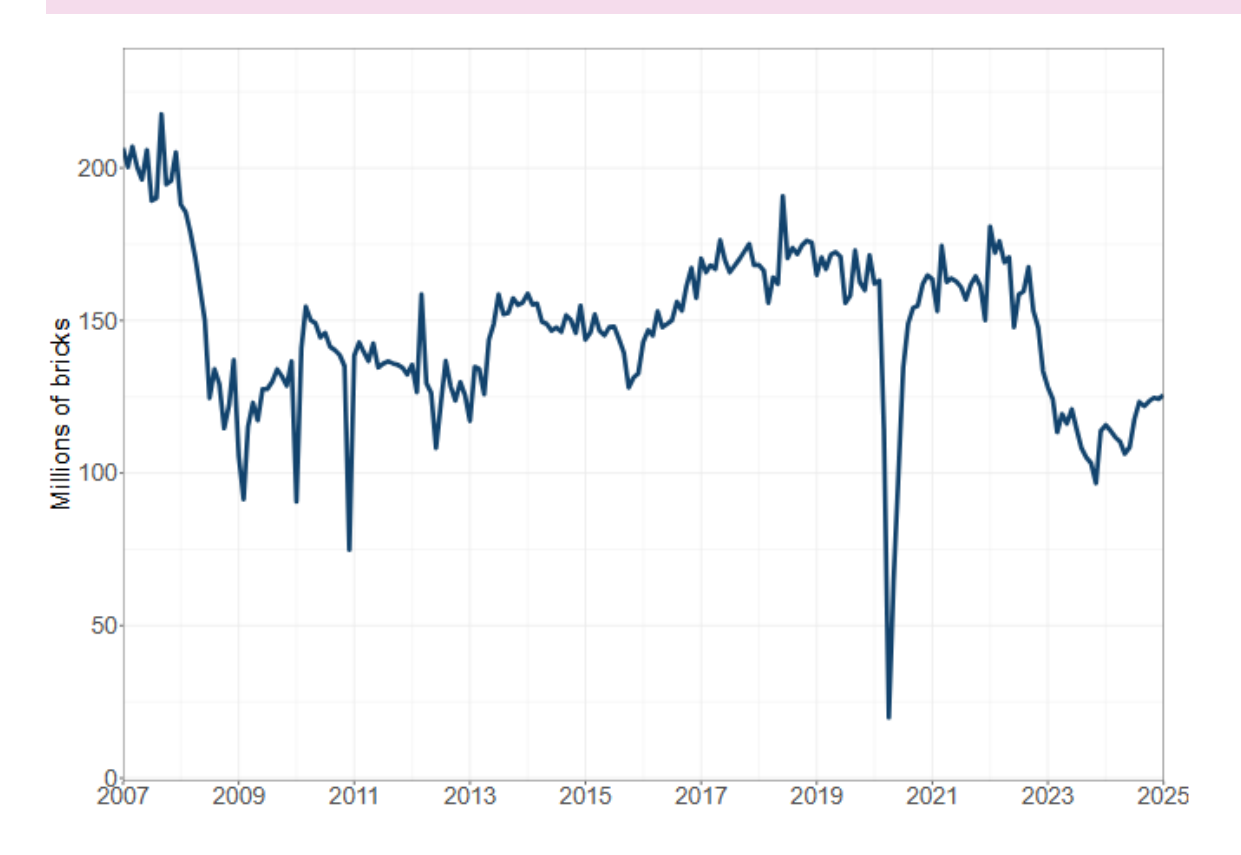
Figure 2: Monthly seasonally adjusted deliveries of bricks (in millions), Great Britain, 2007 to January 2025

Source: monthly statistics of building materials and components, table 9